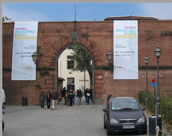
The Fortezza da Basso (whose official name is Fortress of St. John the Baptist) the entrance to the Biennale (bi-annual), one of the most prestigious art exhibits in the world.