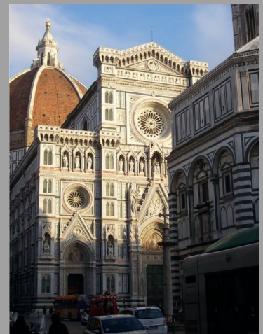
The Duomo (the dome) above, one of Firenze's most prestigious churches, as the sun was setting.