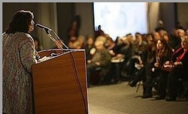
Carol's addresses an audience of over 400.