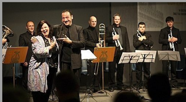
The bow to a standing ovation.

http://www.carolworthey.com/sounds/fanfare.html