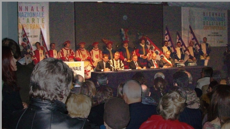
The Biennale's opening ceremony with over 1000 celebrants in attendance.