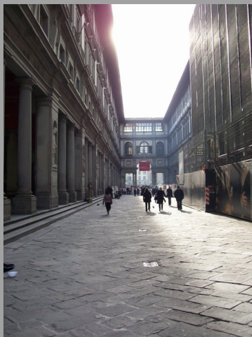
Above is the Uffizi (offices) opened in 1560. It is one of the oldest and most famous art museums in the world. It houses works by Botticelli, Michelangelo and Rembrandt to name a few.